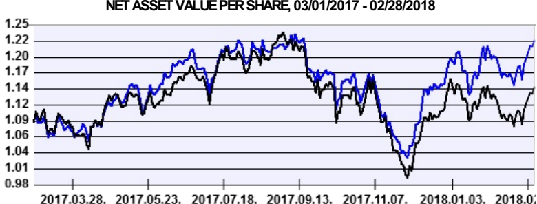
NET ASSET VALUE PER SHARE, 03/01/2017 - 02/28/2018

— Aegon Istanbul Equity Fund PI series — Benchmark