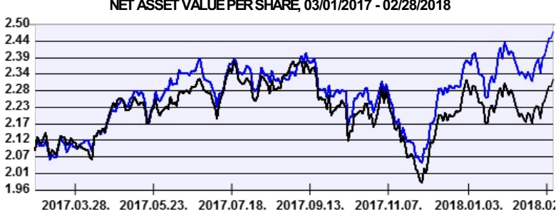
NET ASSET VALUE PER SHARE, 03/01/2017 - 02/28/2018

— Aegon Istanbul Equity Fund institutional series — Benchmark