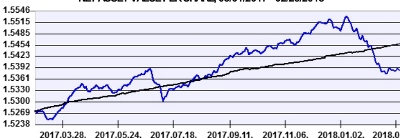
NET ASSET VALUE PER SHARE, 03/01/2017 - 02/28/2018

— Aegon BondMaxx Total Return Bond Investment Fund HUF series — Benchmark