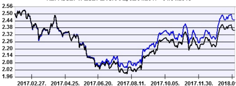
NET ASSET VALUE PER SHARE, 02/01/2017 - 01/31/2018

Past performance is no guarantee of future results. This report should not be considered as an offer or investment advisory. The Fund Prospectus contains the detailed conditions of the investment. The distribution costs of the fund purchase can be found at the distributors.