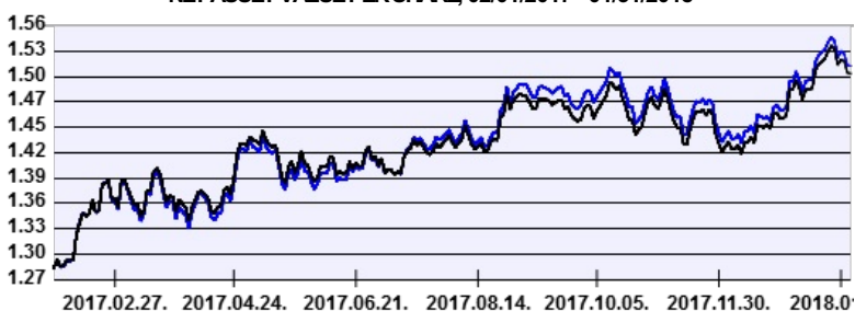
NET ASSET VALUE PER SHARE, 02/01/2017 - 01/31/2018

— Aegon Polish Equity Fund institutional series — Benchmark