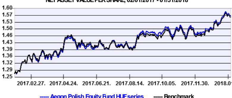
NET ASSET VALUE PER SHARE, 02/01/2017 - 01/31/2018

Past performance is no guarantee of future results. This report should not be considered as an offer or investment advisory. The Fund Prospectus contains the detailed conditions of the investment. The distribution costs of the fund purchase can be found at the distributors.