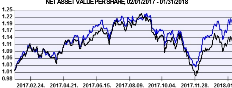
NET ASSET VALUE PER SHARE, 02/01/2017 - 01/31/2018

— Aegon Istanbul Equity Fund PI series — Benchmark