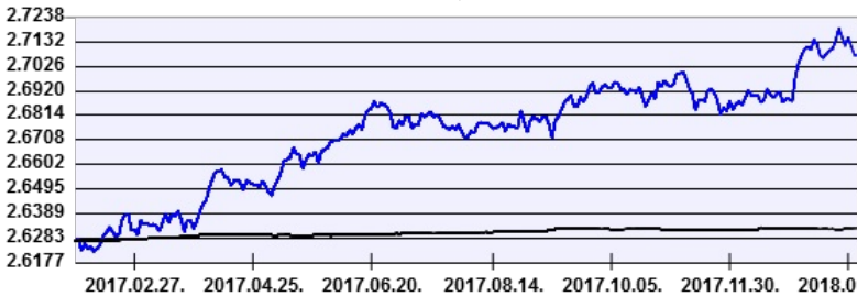
NET ASSET VALUE PER SHARE, 02/01/2017 - 01/31/2018

Past performance is no guarantee of future results. This report should not be considered as an offer or investment advisory. The Fund Prospectus contains the detailed conditions of the investment. The distribution costs of the fund purchase can be found at the distributors.