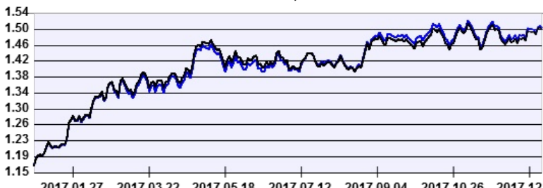
NET ASSET VALUE PER SHARE, 01/01/2017 - 12/31/2017

— Aegon Polish Equity Fund HUF series — Benchmark