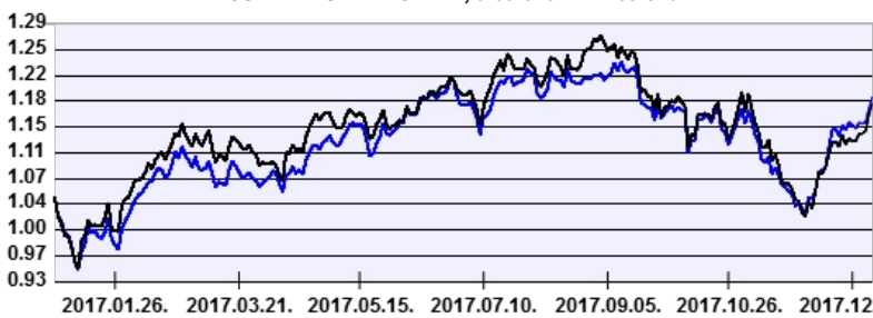
NET ASSET VALUE PER SHARE, 01/01/2017 - 12/31/2017

— Aegon Istanbul Equity Fund PI series — Benchmark