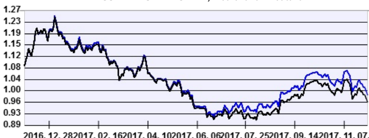
NET ASSET VALUE PER SHARE, 12/01/2016 - 11/30/2017

— Aegon Russia Equity Fund PLN series — Benchmark