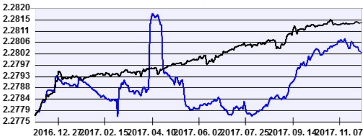
NET ASSET VALUE PER SHARE, 12/01/2016 - 11/30/2017

— Aegon Money Market Fund HUF series — Benchmark