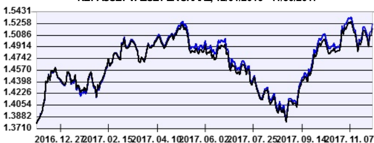
NET ASSET VALUE PER SHARE, 12/01/2016 - 11/30/2017

— Aegon International Equity Fund institutional series — Benchmark