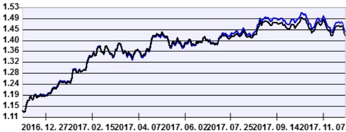
NET ASSET VALUE PER SHARE, 12/01/2016 - 11/30/2017

— Aegon Polish Equity Fund institutional series — Benchmark