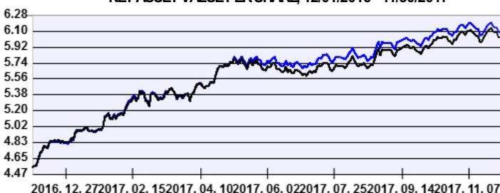
NET ASSET VALUE PER SHARE, 12/01/2016 - 11/30/2017

— Aegon Central European Equity Fund institutional series — Benchmark