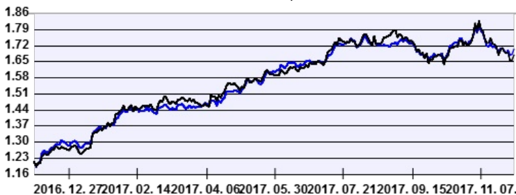
NET ASSET VALUE PER SHARE, 12/01/2016 - 11/30/2017

— Aegon Istanbul Equity Fund TRY series — Benchmark