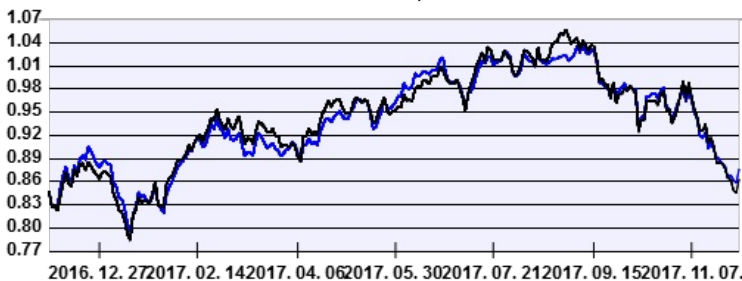
NET ASSET VALUE PER SHARE, 12/01/2016 - 11/30/2017

— Aegon Istanbul Equity Fund PLN series — Benchmark