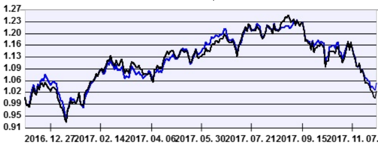
NET ASSET VALUE PER SHARE, 12/01/2016 - 11/30/2017

— Aegon IstanBull Equity Fund PI series — Benchmark