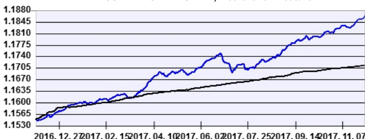
NET ASSET VALUE PER SHARE, 12/01/2016 - 11/30/2017

--- Aegon BondMaxx Total Return Bond Investment Fund PLN series --- Benchmark