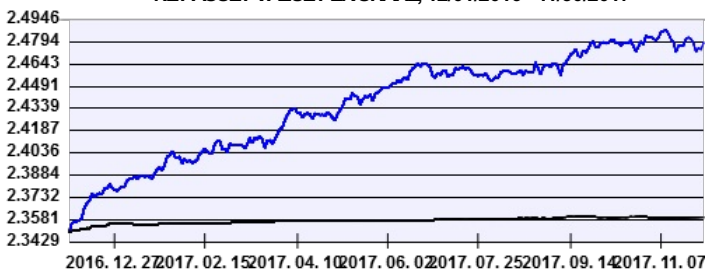
NET ASSET VALUE PER SHARE, 12/01/2016 - 11/30/2017

— Aegon Alfa Total Return Investment Fund PLN series — Benchmark