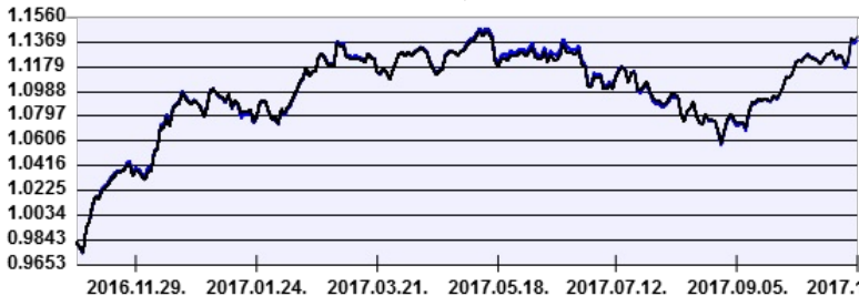
NET ASSET VALUE PER SHARE, 11/01/2016 - 10/31/2017

— Aegon International Equity Fund EUR series — Benchmark