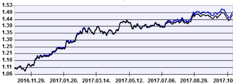
NET ASSET VALUE PER SHARE, 11/01/2016 - 10/31/2017