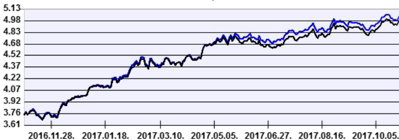
NET ASSET VALUE PER SHARE, 11/01/2016 - 10/31/2017

Past performance is no guarantee of future results. This report should not be considered as an offer or investment advisory. The Fund Prospectus contains the detailed conditions of the investment. The distribution costs of the fund purchase can be found at the distributors.