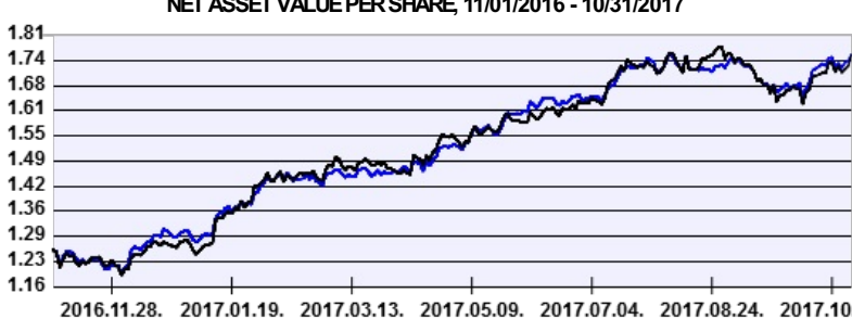
NET ASSET VALUE PER SHARE, 11/01/2016 - 10/31/2017

— Aegon Istanbul Equity Fund TRY series — Benchmark