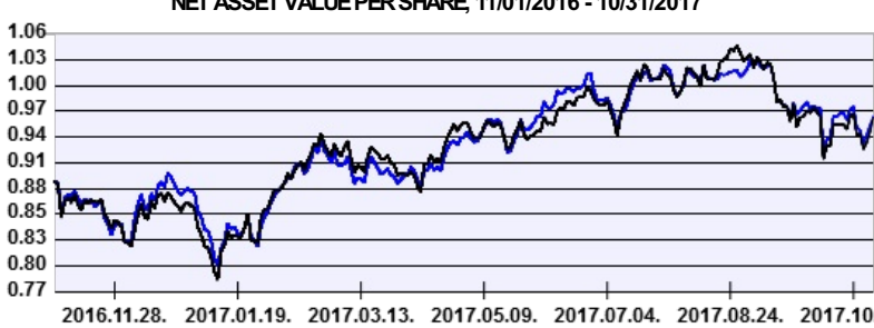
NET ASSET VALUE PER SHARE, 11/01/2016 - 10/31/2017

— Aegon Istanbul Equity Fund PLN series — Benchmark