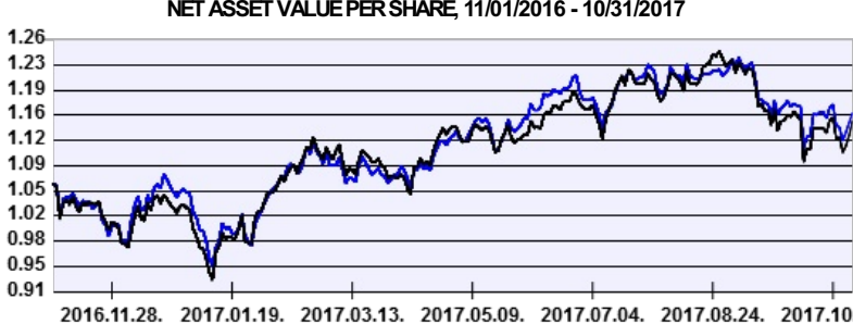
NET ASSET VALUE PER SHARE, 11/01/2016 - 10/31/2017

— Aegon Istanbul Equity Fund PI series — Benchmark