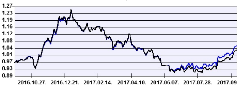
NET ASSET VALUE PER SHARE, 10/01/2016 - 09/30/2017

— Aegon Russia Equity Fund PLN series — Benchmark