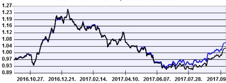
NET ASSET VALUE PER SHARE, 10/01/2016 - 09/30/2017

— Aegon Russia Equity Fund PI series — Benchmark