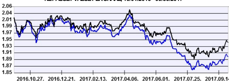
NET ASSET VALUE PER SHARE, 10/01/2016 - 09/30/2017

— Aegon International Bond Fund — Benchmark