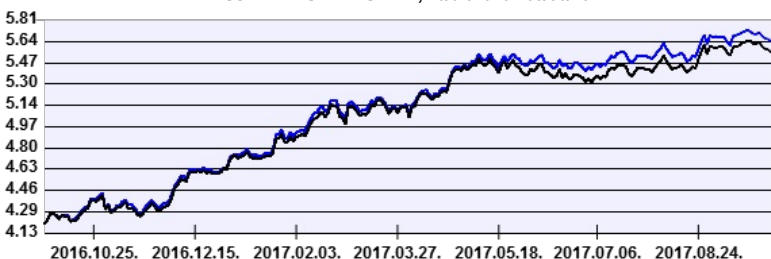
NET ASSET VALUE PER SHARE, 10/01/2016 - 09/30/2017

----- Aegon Central European Equity Fund HUF series ----- Benchmark