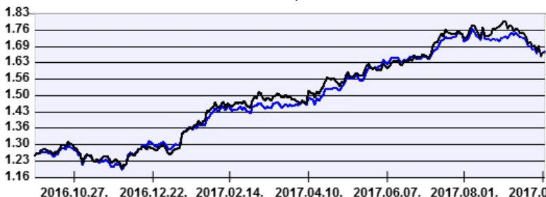
NET ASSET VALUE PER SHARE, 10/01/2016 - 09/30/2017

— Aegon Istanbul Equity Fund TRY series — Benchmark