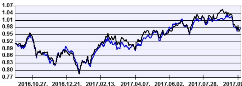
NET ASSET VALUE PER SHARE, 10/01/2016 - 09/30/2017

— Aegon Istanbul Equity Fund PLN series — Benchmark