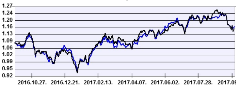
NET ASSET VALUE PER SHARE, 10/01/2016 - 09/30/2017

— Aegon Istanbul Equity Fund PI series — Benchmark