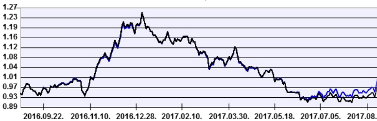
NET ASSET VALUE PER SHARE, 09/01/2016 - 08/31/2017

— Aegon Russia Equity Fund PLN series — Benchmark