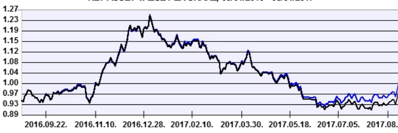
NET ASSET VALUE PER SHARE, 09/01/2016 - 08/31/2017

— Aegon Russia Equity Fund PI series — Benchmark