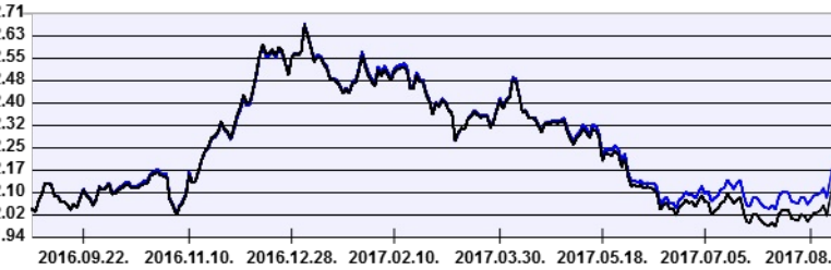
NET ASSET VALUE PER SHARE, 09/01/2016 - 08/31/2017

— Aegon Russia Equity Fund institutional series — Benchmark