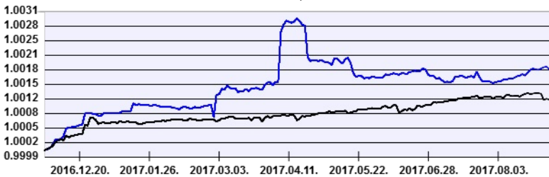
NET ASSET VALUE PER SHARE, 12/01/2016 - 08/31/2017

— Aegon Money Market Fund institutional series — Benchmark