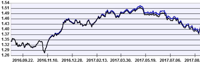
NET ASSET VALUE PER SHARE, 09/01/2016 - 08/31/2017

— Aegon International Equity Fund institutional series — Benchmark