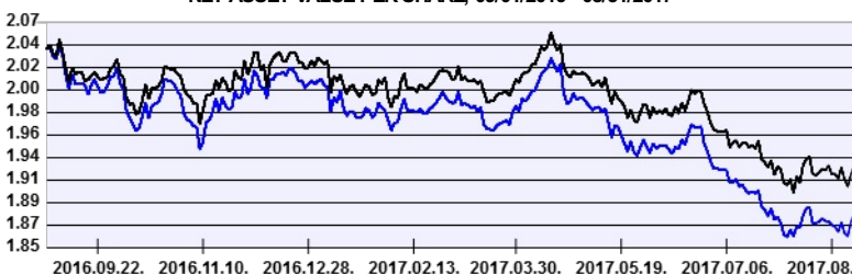
NET ASSET VALUE PER SHARE, 09/01/2016 - 08/31/2017

Past performance is no guarantee of future results. This report should not be considered as an offer or investment advisory. The Fund Prospectus contains the detailed conditions of the investment. The distribution costs of the fund purchase can be found at the distributors.