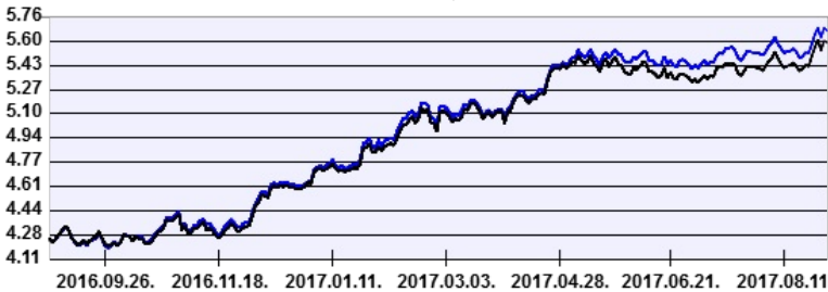
NET ASSET VALUE PER SHARE, 09/01/2016 - 08/31/2017

— Aegon Central European Equity Fund HUF series — Benchmark