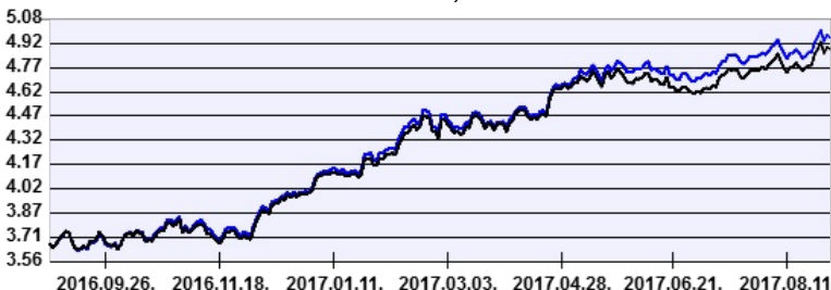
NET ASSET VALUE PER SHARE, 09/01/2016 - 08/31/2017

— Aegon Central European Equity Fund EUR series — Benchmark