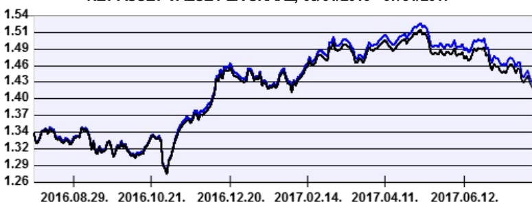
NET ASSET VALUE PER SHARE, 08/01/2016 - 07/31/2017

— Aegon International Equity Fund institutional series — Benchmark