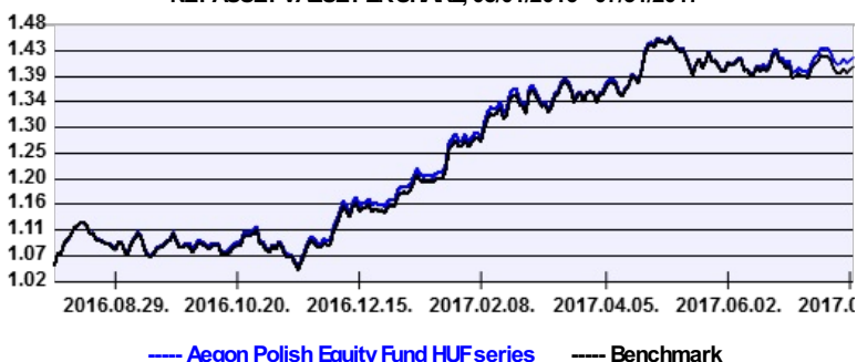
NET ASSET VALUE PER SHARE, 08/01/2016 - 07/31/2017

Past performance is no guarantee of future results. This report should not be considered as an offer or investment advisory. The Fund Prospectus contains the detailed conditions of the investment. The distribution costs of the fund purchase can be found at the distributors.