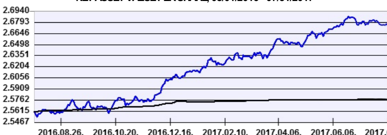
NET ASSET VALUE PER SHARE, 08/01/2016 - 07/31/2017

--- Aegon Alfa Total Return Investment Fund HUF series --- Benchmark Past performance is no guarantee of future results. This report should not be considered as an offer or investment advisory. The Fund Prospectus contains the detailed conditions of the investment. The distribution costs of the fund purchase can be found at the distributors.