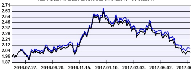
NET ASSET VALUE PER SHARE, 07/01/2016 - 06/30/2017

— Aegon Russia Equity Fund institutional series — Benchmark