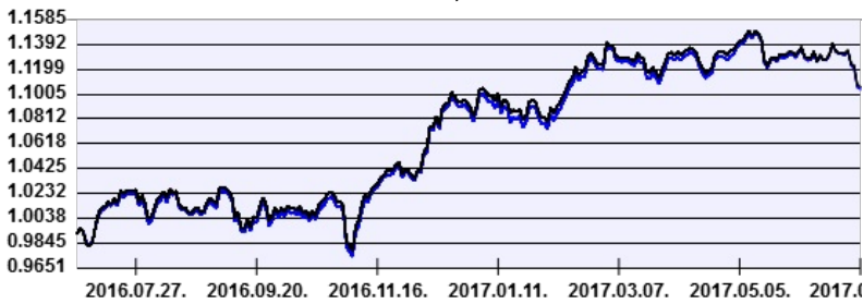
NET ASSET VALUE PER SHARE, 07/01/2016 - 06/30/2017

— Aegon International Equity Fund EUR series — Benchmark