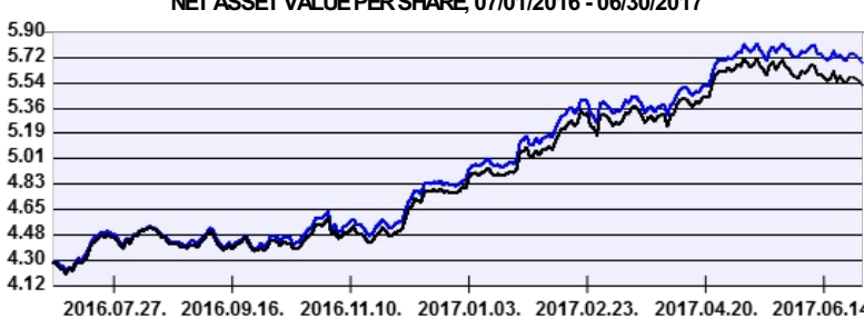
NET ASSET VALUE PER SHARE, 07/01/2016 - 06/30/2017

— Aegon Central European Equity Fund institutional series — Benchmark