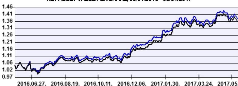
NET ASSET VALUE PER SHARE, 06/01/2016 - 05/31/2017

— Aegon Polish Equity Fund institutional series — Benchmark