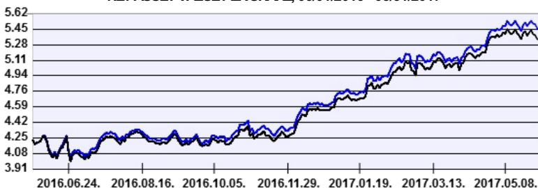
NET ASSET VALUE PER SHARE, 06/01/2016 - 05/31/2017

— Aegon Central European Equity Fund HUF series — Benchmark