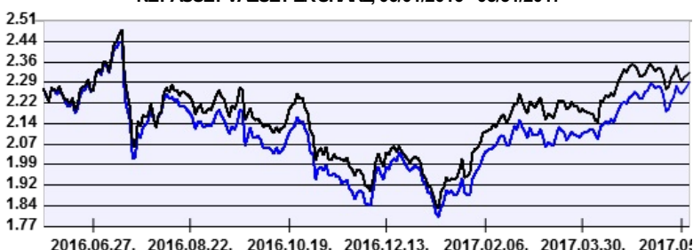
NET ASSET VALUE PER SHARE, 06/01/2016 - 05/31/2017

— Aegon Istanbul Equity Fund institutional series — Benchmark